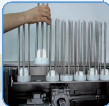
Changeable paper cup dispenser.

On request we manufacture special filling, injecting and paper cup dispenser machines to your unique requirements. Whit different kind and numbers of nozzles, many cap sizes, special measure trays, moulds or another technical modifications.