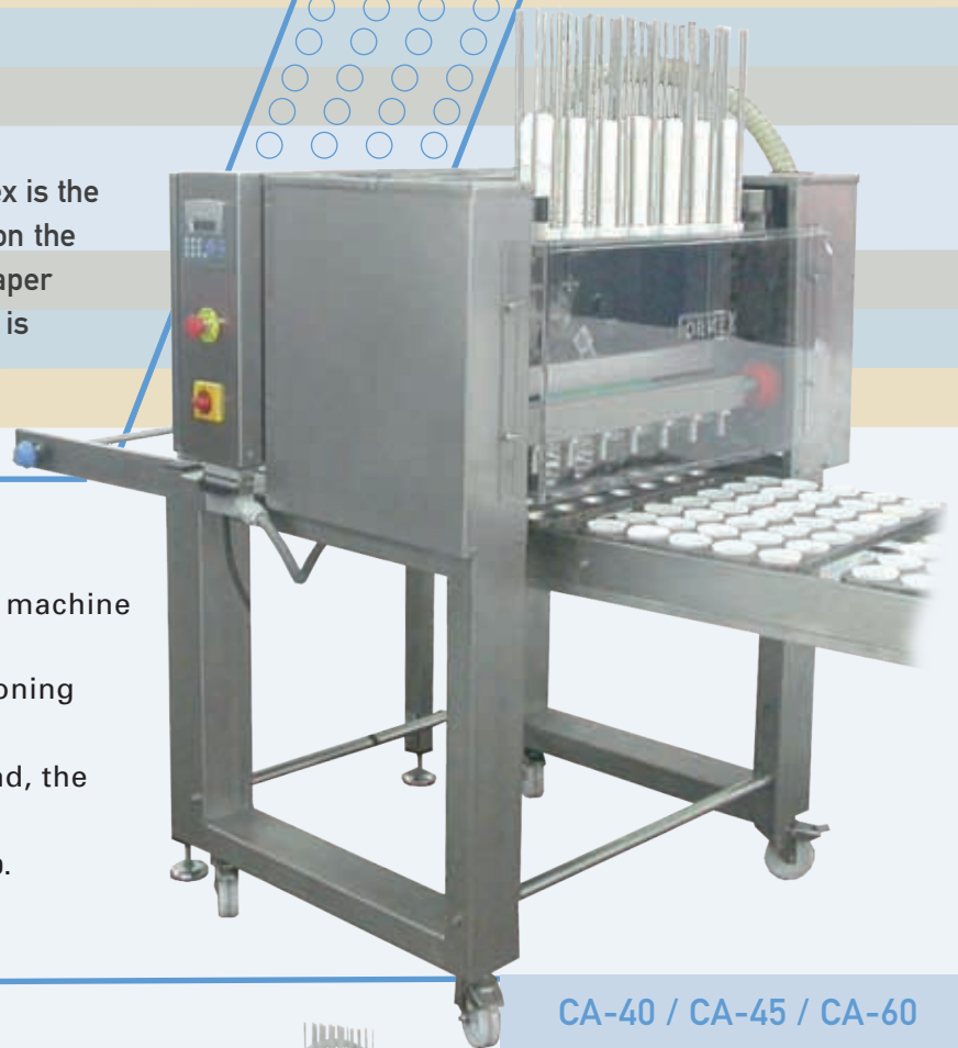
CA-40 / CA-45 / CA-60

The machine are sturdy and being built to work 24 hours. To make easy the machine transport they have wheels. With a 1 year warranty.