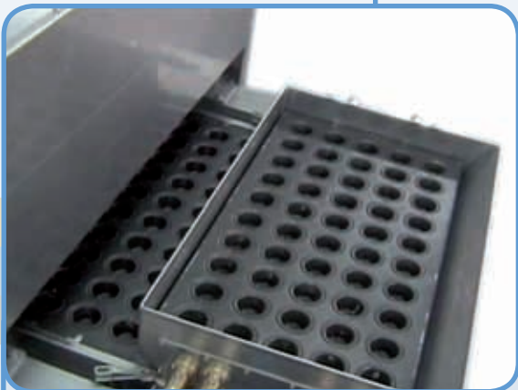
Optional: Panning unit.