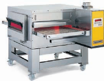
SYN 08/50 V