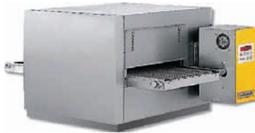
SYN 05/40 V

The tunnel ovens, thanks to its ventilation system, makes it possible to ensure excellent and uniform baking. In fact, the flow of hot air surrounds the product. Removing the barrier of colder air that normally insulates it, so as to ensure a uniform distribution of the heat but in the appropriate dosage to prevent the product from drying out excessively and to give it the proper fragrance.