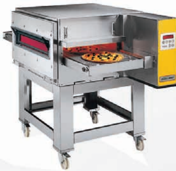
SYN 10/65V SYN 10/75V