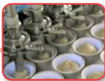
Special nozzles for "MA" modul.