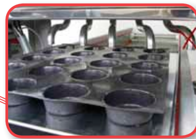
Special nozzles for "MA" modul.