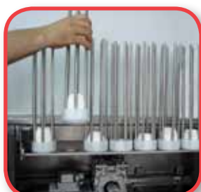
Cup unit easy to extract and change it.