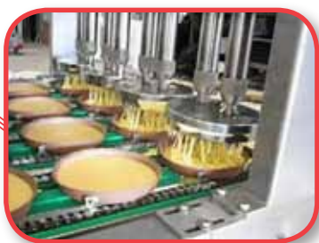
Special nozzles to dose cakes.

With the Formex Modular Lines you could have the perfect shaping to make your product.